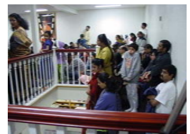
Crowded Classroom in Sandeepany