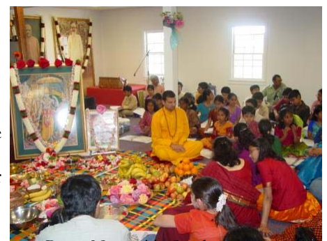
Rama Navami in Sandeepany

Festivals and other events are an integral part of the Chinmaya vision, where the community comes together to perform pujas, celebrate festivals, and observe or commemorate events. Most Indian festivals and notable events are organized and celebrated, and Sandeepany San Jose is the hub for all these activities. With increased devotee participation in these activities the place has been bursting at its seams during these events, and just unable to accommodate everyone. Further more, it is no secret that many more who would like to participate refrain from trying, primarily due to the lack of adequate parking. Those who come are forced either to park far away and walk, or, occasionally, to turn back. To alleviate these problems, Chinmaya Mission San Jose has in recent years taken to holding popular events at the Jain Temple and other such rental facilities.