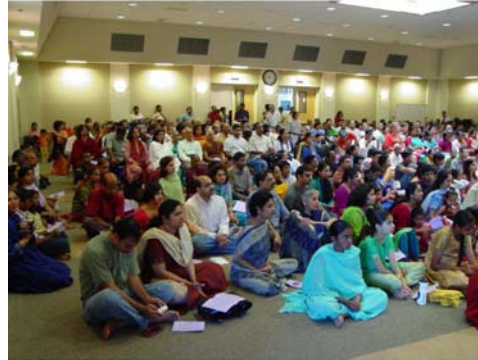
Program during Swami Tejomayananda visit – in Jain Temple – too small to accommodate the gathering