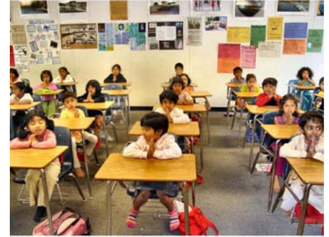
A Bala Vihar Class in Lincoln High School

The rental facilities we use to provide for our community’s needs are often very expensive, making renting on a regular basis an unviable proposition. Perhaps more importantly, in many cases, these facilities are inadequate for our needs and/or not available on the dates we need them. As a result, we are on the constant lookout for new rental facilities that are both suitable and affordable. Unfortunately, such facilities are few and far between and in ever-increasing demand.