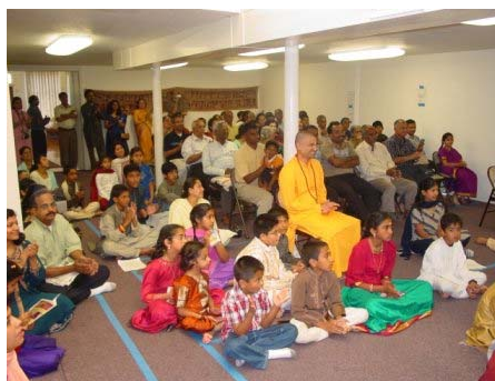
Gita Chanting Competition in Sandeepany