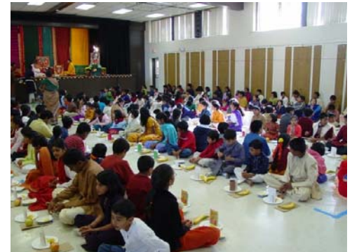
Diwali Samashti Pooja in Hillview Community Center