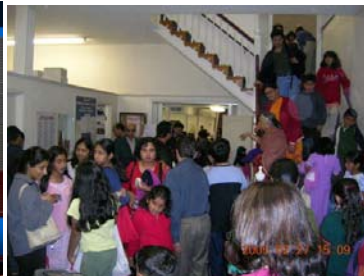
After Classes Crowd