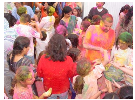
Holi in Sandeepany