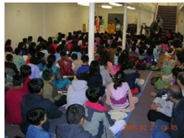
Bal Vihar Assembly in Sandeepany