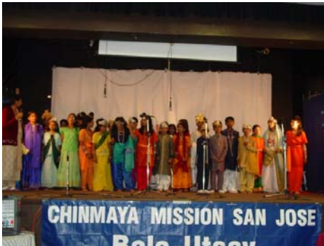
Bal Utsav facility in Hillview Community Center – stage too small for large number of participants