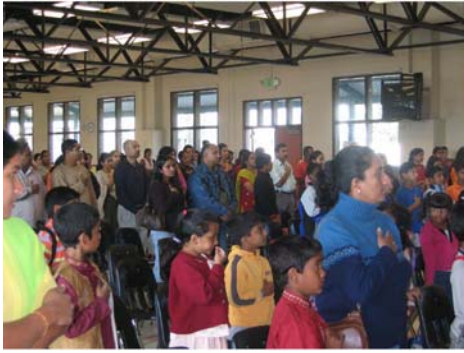
School Assembly in Fremont – already crowded

The rental facilities we use to provide for our community’s needs are often very expensive, making renting on a regular basis an unviable proposition. Perhaps more importantly, in many cases, these facilities are inadequate for our needs and/or not available on the dates we need them. As a result, we are on the constant lookout for new rental facilities that are both suitable and affordable. Unfortunately, such facilities are few and far between and in ever-increasing demand.