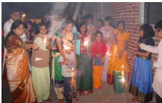
Diwali Festival at Sandeepany