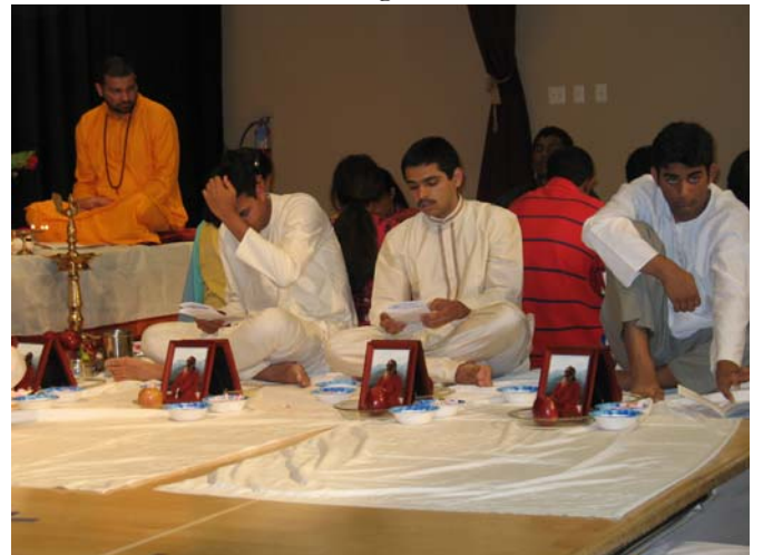
Paduka Puja by Students