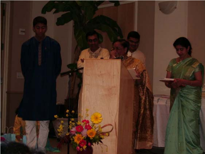
Presentation of Awards