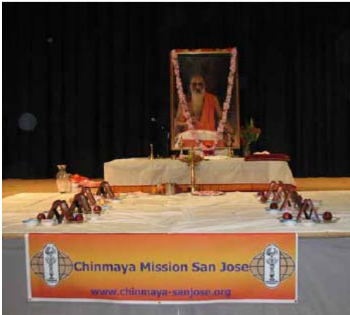
Stage all set for the graduates to perform Paduka Puja

For some, leaving the nest was an emotional time – something that they had looked forward to all their lives, but now that it was here, it was an overwhelming experience. For some others, this was yet another milestone in the journey of life. Four of the thirteen graduates came forward to share their experiences of Bala Vihar with the rest of the audience.